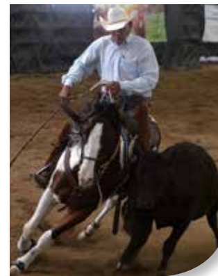
Smoky Pritchett NRCHA Hall of Fame

Simply visit www.grandmeadows.com and view information about our products, read testimonials from leading riders and equine experts, compare nutritional ingredients between Grand Meadows and competitor's products and locate an authorized retailer near you or place an order online and have it shipped directly to your front door.